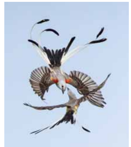
Scissor-tailed Flycatchers in courtship at Polishing Pond