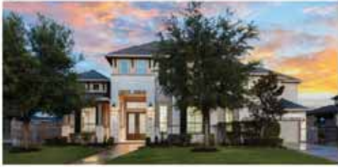
28211 ISLAND MANOR LN | FULSHEAR, TX