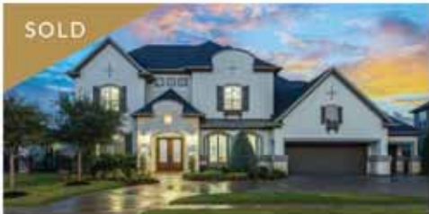
27911 STARLIGHT HARBOR LN | FULSHEAR, TX