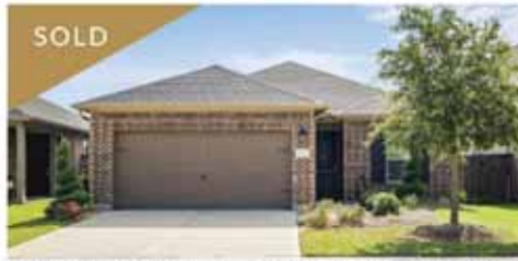
5815 PEDERNALES BEND LN | FULSHEAR, TX