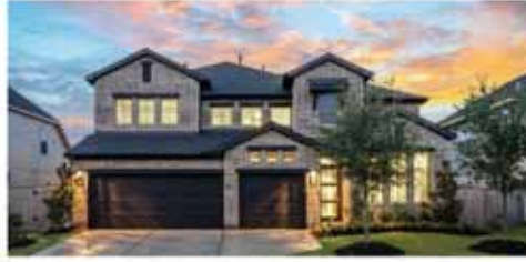
4207 ANA RIDGE LN | FULSHEAR, TX