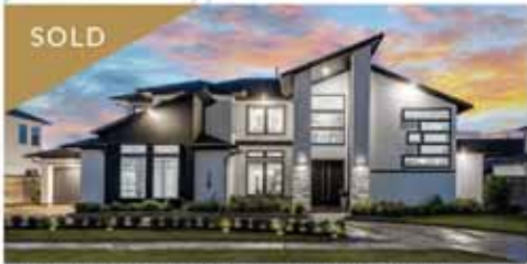
27914 INDIGO RIDGE DR | FULSHEAR, TX