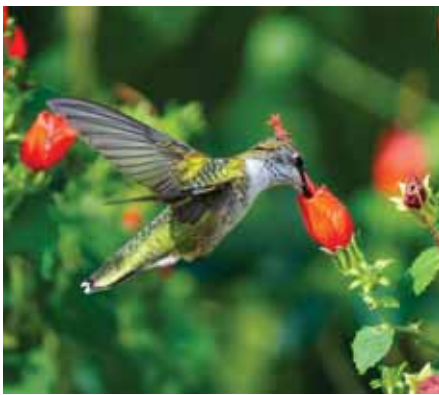
Ruby-throated Hummingbird feeding on native Turk's Cap flowers.

It is with great relief that we welcome Fall back to Southeast Texas, with the associated return to double digit temperatures. As the season changes, our scorched vegetation will hopefully get a chance for renewal. During these months, our skies are full of millions of birds migrating overhead, while our resident wildlife adapts to the changing of seasons. Finally, the slipping temperatures means that time spent out of doors becomes a much more enjoyable option around the neighborhood.