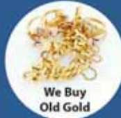
We Buy Old Gold

Ideal Diamond Buyers • 8045 FM 359 Rd S. • Fulshear