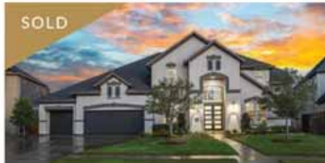
27927 STARLIGHT HARBOR LN | FULSHEAR, TX