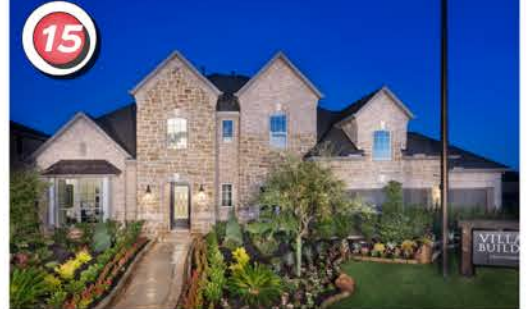
Village Builders 80' Dunlin Cove & Teal Trace From the $510's 28323 Sparkling Brook Ln. (281) 533-6522 Katy ISD