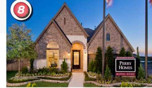
Perry Homes 55' Bluestem From the $350's 28403 Sycamore Falls Dr. (281) 633-2555 Katy ISD