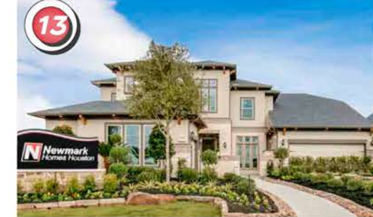
Newmark Homes 70' Cypress Edge & Whimbrel Lake From the $490's 27806 Harper Meadow Ln. (832) 403-3111 Katy ISD