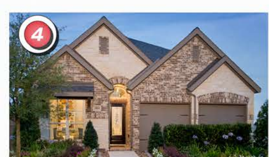
Perry Homes 50' Indigo Trails From the $280's 29111 Sage Meadow Trail (281) 232-7970 Lamar Consolidated ISD