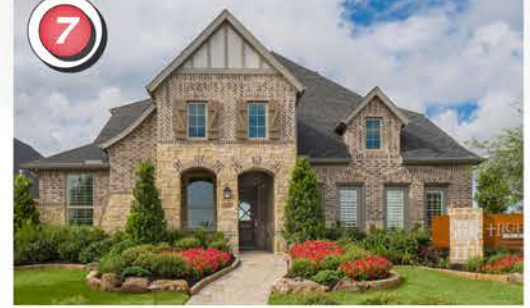
Highland Homes 55' Bluestem From the $310's 28407 Sycamore Falls Dr. (832) 759-6460 Katy ISD