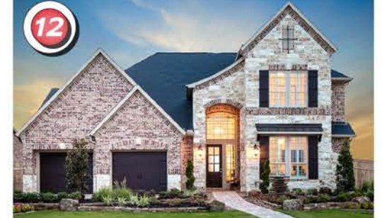
Trendmaker Homes 65' Egret Lake & Warbler Cove From the $450's 28607 Thornsby Ridge Ct. (281) 675-3736 Katy ISD