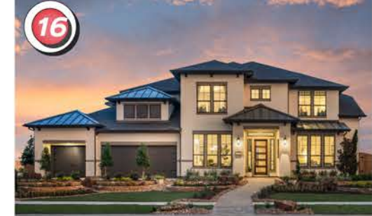
Trendmaker Homes 80' Dunlin Cove & Teal Trace From the $600's 28319 Sparkling Brook Ln. (281) 342-5486 Katy ISD