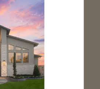
Partners in Building 90' Sora Lake & Quail Point From the $700's 28014 Sky Haven Ln. (832) 452-2060 Katy ISD