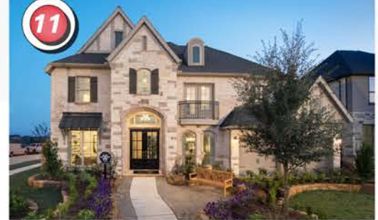
Perry Homes 65' Egret Lake & Warbler Cove From the $440's 28603 Thornsby Ridge Ct. (281) 633-8500 Katy ISD