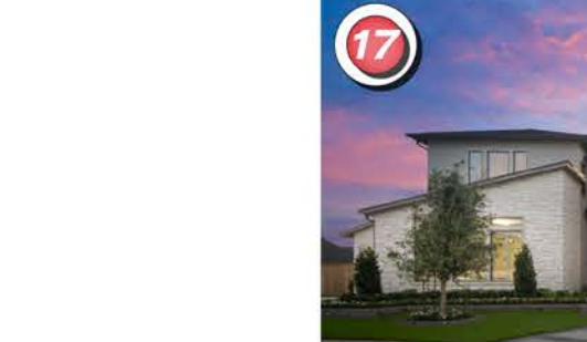
Avanti Homes 90' / Sora Lake & Quail Point From the $690's Modeling with Trendmaker 80' 28319 Sparkling Brook Ln. (281) 342-5486 Katy ISD