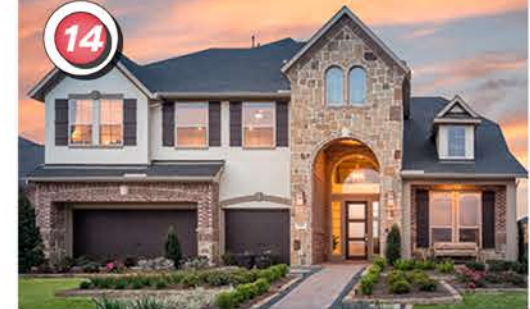
Trendmaker Homes 70' Cypress Edge & Whimbrel Lake From the $500's 28406 Vineyard Terrace Ln. (281) 675-3737 Katy ISD