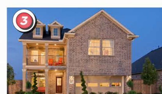
Chesmar Homes 50' Indigo Trail From the $250's 29115 Sage Meadow Trail (832) 684-7004 Lamar Consolidated ISD