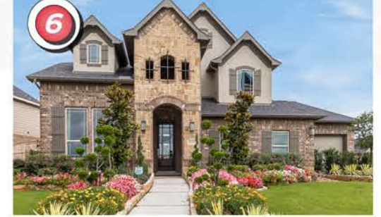
Newmark Homes 50' Bluestem From the $300's 3503 Canyon Branch Ln. (832) 572-5597 Katy ISD