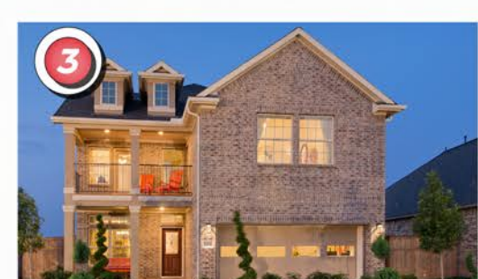
3 Chesmar Homes 50' Indigo Trail From the $250's 29115 Sage Meadow Trail (832) 684-7004 Lamar Consolidated ISD