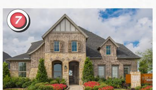
7 Highland Homes 55' Bluestem From the $320's 28407 Sycamore Falls Dr. (832) 759-6460 Open Weekends Only