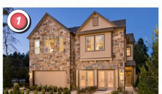
1 Chesmar Townhomes Willows & Gables From the $200's 5550 Sallow Bay Ln. (832) 457-8952 Lamar Consolidated ISD