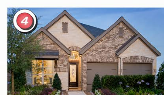
4 Perry Homes 50' Indigo Trails From the $280's 29111 Sage Meadow Trail (281) 232-7970 Lamar Consolidated ISD