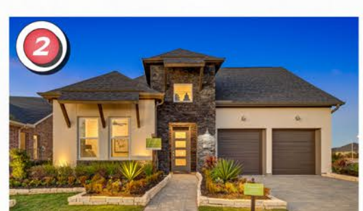
2 Bonterra at Cross Creek Ranch Gated Community for 55+ Active Adults From the $220's 5706 Pedernales Bend Ln. (281) 207-6682