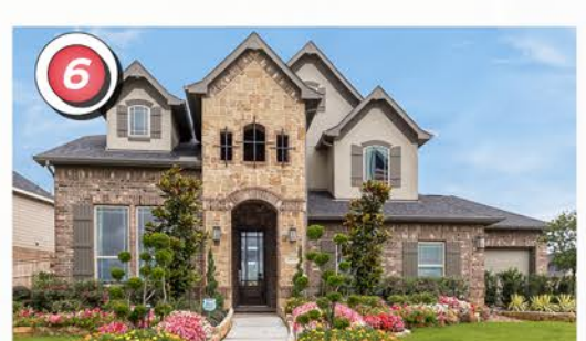
6 Newmark Homes 50' Bluestem From the $300's 3503 Canyon Branch Ln. (832) 572-5597 Katy ISD