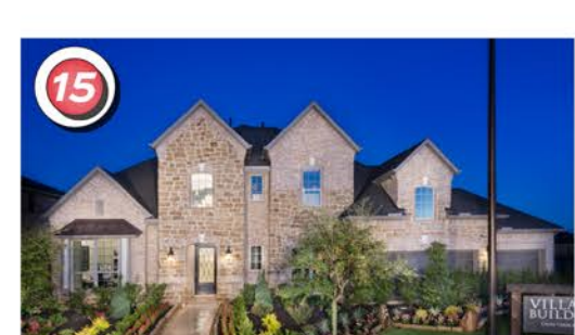
15 Village Builders 80' Dunlin Cove & Teal Trace From the $510's 28323 Sparkling Brook Ln. (281) 533-6522 Katy ISD