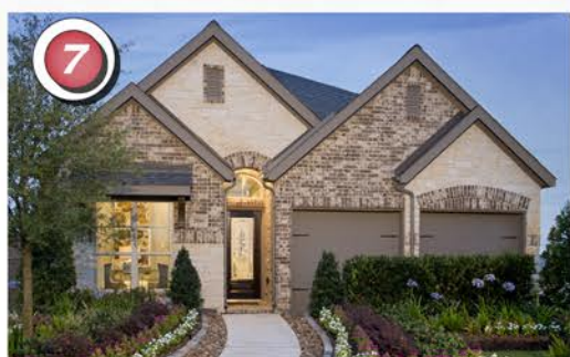
Perry Homes 50' Indigo Trails From the $330's 29111 Sage Meadow Trail (281) 232-7970 Lamar CISD