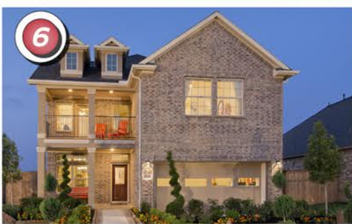
Chesmar Homes 50' Indigo Trail From the $320's 29115 Sage Meadow Trail (832) 684-7004 Lamar CISD