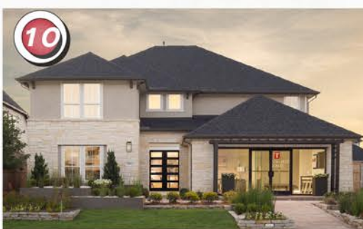
Trendmaker Homes 60' Warbler Cove From the $460's 28614 Casen Ranch Ln. (281) 675-3735 Katy ISD & Lamar CISD