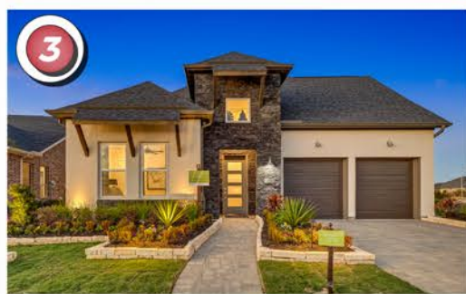
Bonterra at Cross Creek Ranch Gated Community for 55+ Active Adults From the $220's 5730 Pedernales Bend Ln. (281) 207-6682