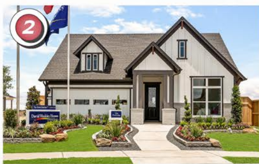
David Weekley Creek View From the $340's 28706 Eden Creek Trail (281) 249-7871 Katy ISD