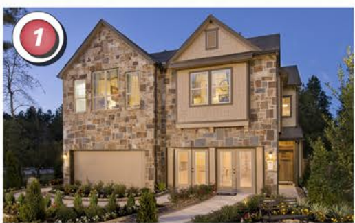
Chesmar Townhomes Willows & Gables From the $220's 5550 Sallow Bay Ln. (832) 457-8952 Lamar CISD