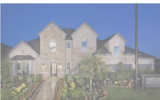
Village Builders 80' Teal Trace From the $550's Model Closed By Appointment Only (281) 533-6522 Katy ISD