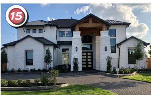
Partners in Building 90' Quail Point From the $800's 27927 Indigo Ridge Ct. (832) 452-2060 Katy ISD