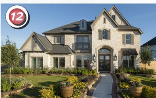
Perry Homes 65' Warbler Cove From the $500's 28807 Jade Springs Ln. (281) 633-8500 Katy ISD & Lamar CISD