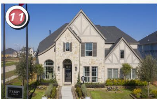
Perry Homes 60' Warbler Cove From the $430's 28618 Casen Ranch Ln. (281) 238-0919 Katy ISD & Lamar CISD