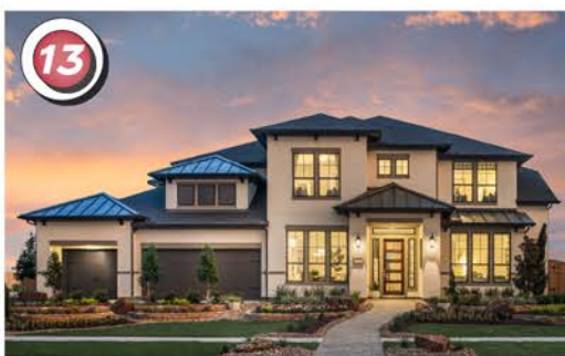
Avanti by Trendmaker 90' Quail Point From the $730's Modeling with Trendmaker 65' 28811 Jade Springs Ln. (281) 675-3736 Katy ISD