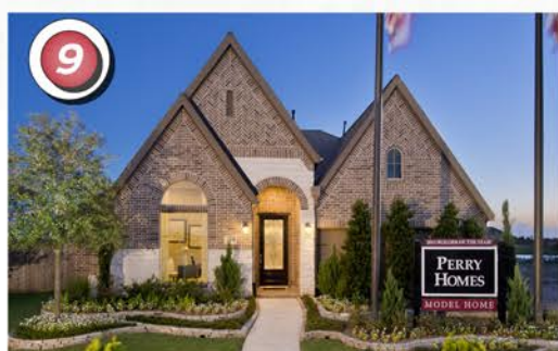
Perry Homes 55' Creek Trace From the $390's 29106 Meadow Terrace Dr. (281) 633-2555 Lamar CISD