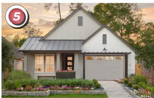
Trendmaker Homes 45' Creek Trace Coming Soon! From the $300's (281) 675-3335 Lamar CISD