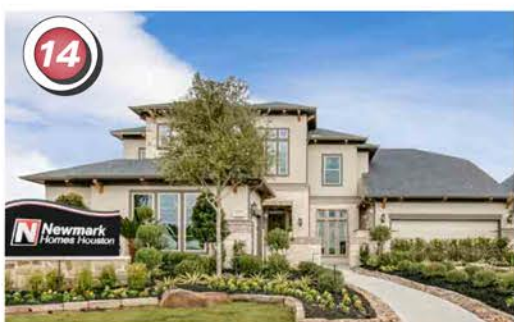
Newmark Homes 70' Cypress Edge From the $520's 27806 Harper Meadow Ln. (832) 403-3111 Katy ISD