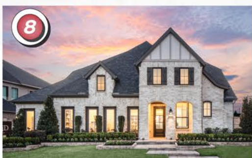
Highland Homes 55' Creek Trace From the $350's 29102 Meadow Terrace Dr. (832) 759-6460 Lamar CISD