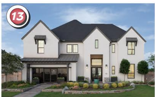
Trendmaker Homes 65' Warbler Cove From the $510's 28811 Jade Springs Ln. (281) 675-3736 Katy ISD & Lamar CISD