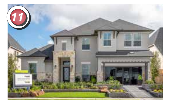
Tri Pointe Homes 65' Sycamore Point