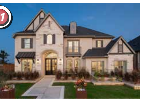
Perry Homes 65' Sycamore Point From the $660's