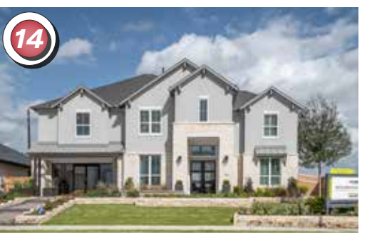
Tri Pointe Homes 70' Ashwood From the $710's

5603 Logan Ridge Ln. (281) 633-8500 Lamar CISD