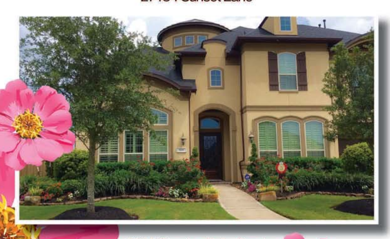
5711 Caspian Falls Court