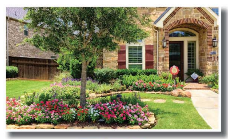
27434 Sunset Lane