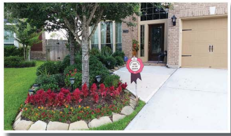
27918 Featherbanks Court