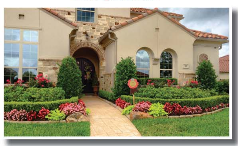
95 Walton Water Way