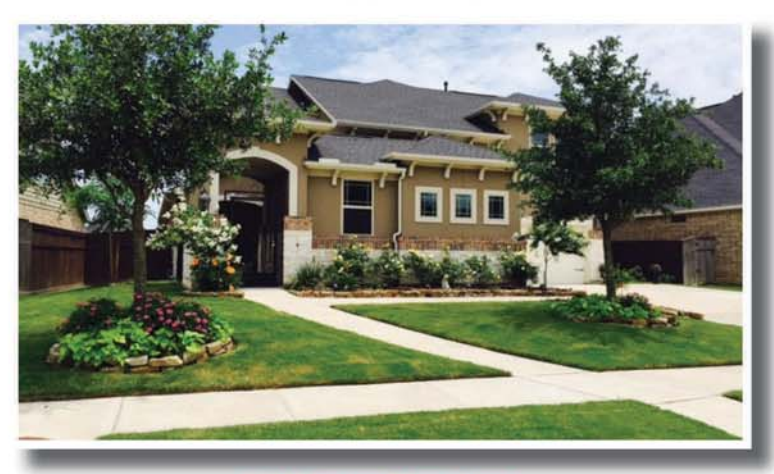
5111 Kenton Place Lane