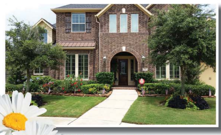
5710 North Choctaw Lane