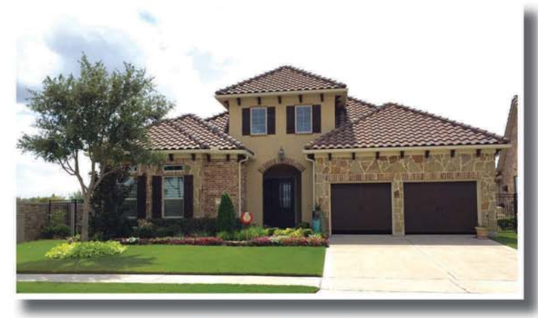
3 Edgemont Court