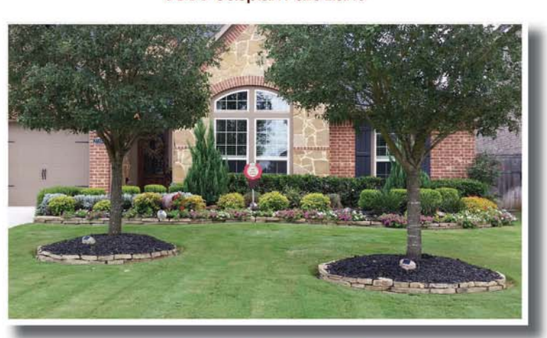
27514 Villa Mountain Court