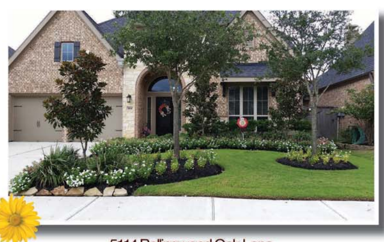
5114 Rollingwood Oak Lane