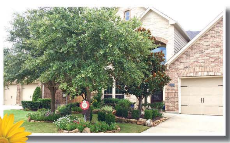
27646 Linden Ridge Lane