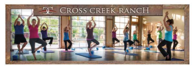
GROUP CLASS SCHEDULE