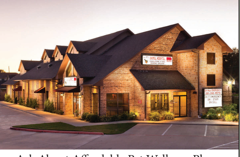
Ask About Affordable Pet Wellness Plans