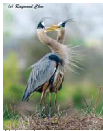
A loving couple