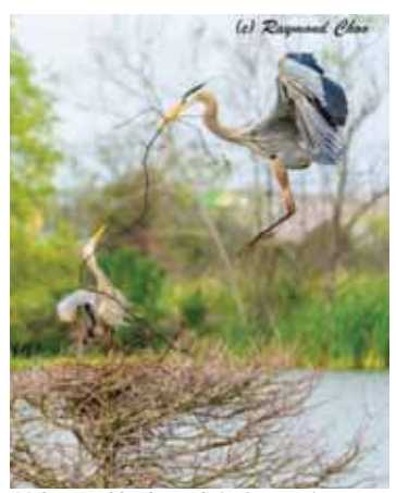
Male great blue heron bringing nesting materials to the female