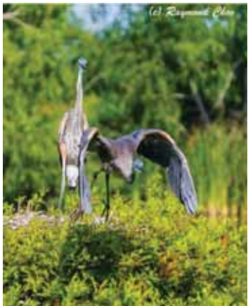
Great blue heron youngster taking its initial flight from the nest