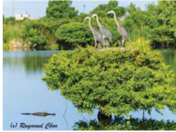
Alligator waiting for any flight mishaps of the juvenile herons