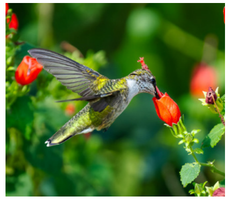
Ruby-throated Hummingbird feeding on native

It is with great relief that we welcome Fall back to Southeast Texas, with the associated return to double digit temperatures. As the season changes, our scorched vegetation will hopefully get a chance for renewal. During these months, our skies are full of millions of birds migrating overhead, while our resident wildlife adapts to the changing of seasons. Finally, the slipping temperatures means that time spent out of doors becomes a much more enjoyable option around the neighborhood.