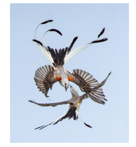
Scissor-tailed Flycatchers in courtship at Polishing Pond

Written by: Amber Leung