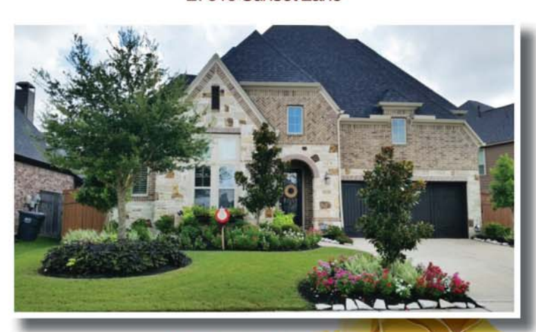
5215 Bartlett Vista Court