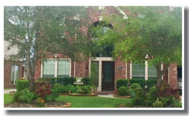
6411 Creekside Park Drive