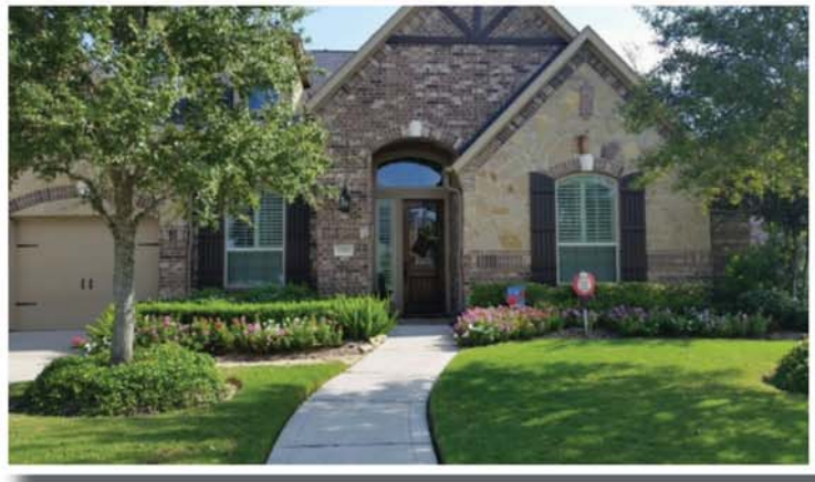
27510 Sunset Lane