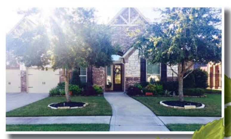
27611 Enclave Court