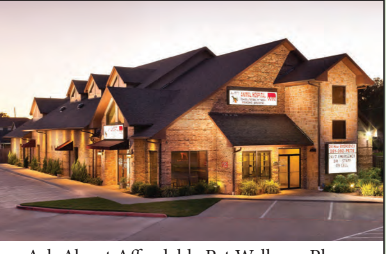
Ask About Affordable Pet Wellness Plans